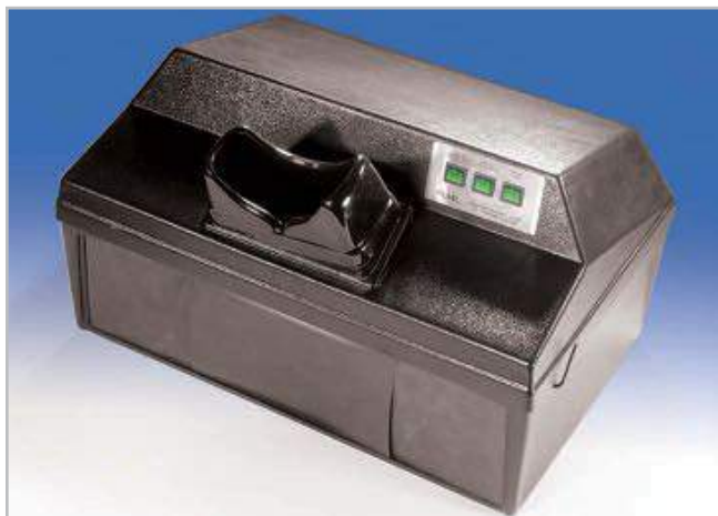
C-70G UV Cabinet includes two each of 15-watt shortwave and longwave UV tubes mounted inside the cabinet; C-71 has four 15-watt longwave tubes

The C-70 and C-71 Chromato-Vue UV viewing cabinets feature a removable bottom panel so the cabinet may be placed over large samples or a transilluminator. These cabinets are made of durable, lightweight plastic.