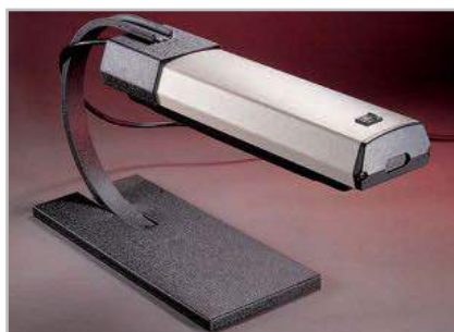
J-138 Stand shown with the 8-watt EL Lamp.

J-138 Stand Dimensions: 10.74H x 13L x 3W in. (273 x 330 x 76mm)