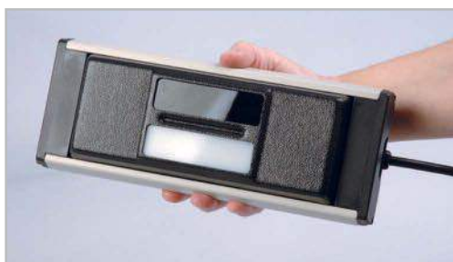
EL Series White/UV lamps include UV and white light (UVS-14 shown).