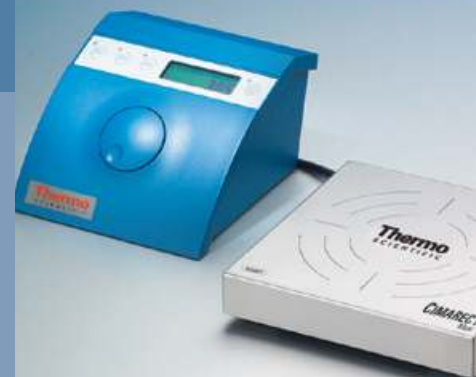
Cimarec i Maxi with Telemodul 20 C