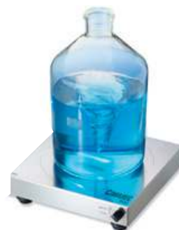
Cimarec Series Mobil Direct

Disc motor-drive stirrers Pages 11 to 13