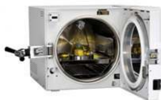
Used in Sterilizers at 121°C 2 bar Pressure Page 11