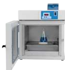
Used in General Purpose Incubator Pages 5 and 7