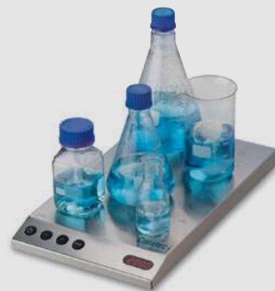
Cimarec i Multipoint 15