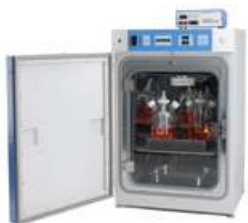
Used in CO 2 Incubator Page 10