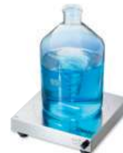
Stir 600 L Carboys Page 12