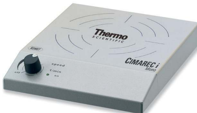
Cimarec i Mono Direct

Operating conditions are -10 to +40°C at 95% rH 100-240 V units contain a cord set with various plugs