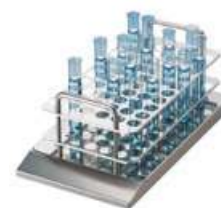
Stir 60 Positions Simultaneously Page 9