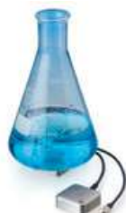
Submersible in 95°C Bath Page 3