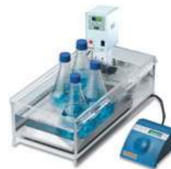
Submersible in 50°C Bath Pages 5 and 7