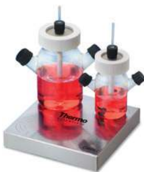
Cimarec Series Biosystem 4