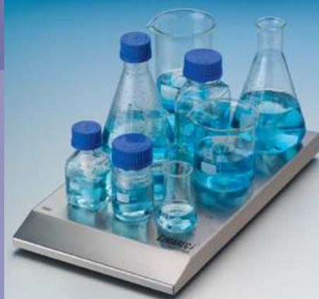
Cimarec i Telesystem 15