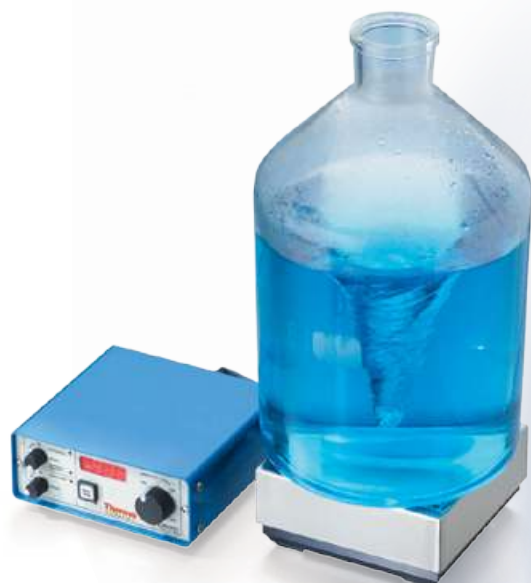
Cimarec Mobil 200 with Telemodul 40 M

Operating conditions are -10 to +56°C at 100% rH