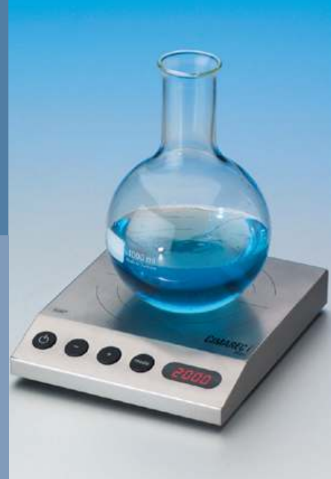
Cimarec i Maxi Direct