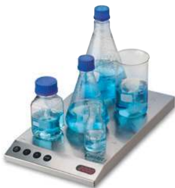
Cimarec i Series Multipoint 15