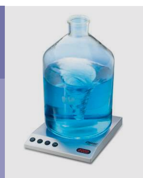
Cimarec Power Direct