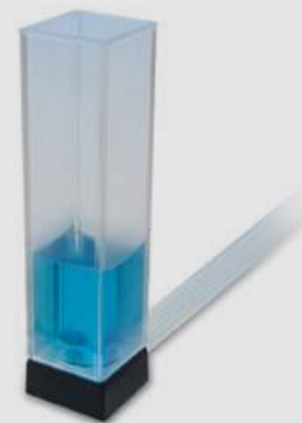
Cimarec i Mini