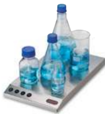
Built-in Controller Convenience Page 6