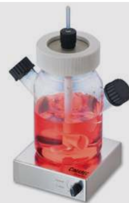
Cimarec Biosystem Direct