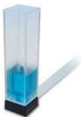
Stir Tiny Cuvettes Page 2